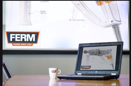
Engineering and design